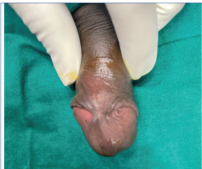
[Table/Fig-1]: Supernumerary frenulum on the dorsal aspect of the penis (Dorsal view).