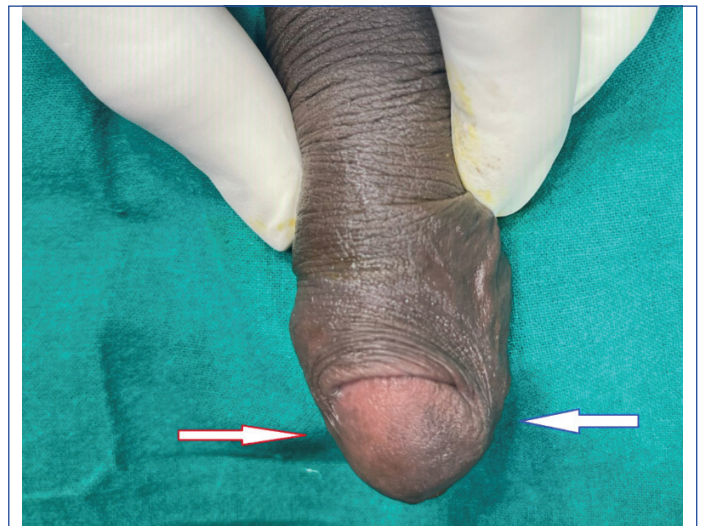
[Table/Fig-2]: Lateral view showing supernumerary dorsal frenulum (Red arrow) and normal ventral frenulum (Blue arrow).

A 29-year-old male who recently got married reported difficulty retracting his foreskin and experienced discomfort during sexual intercourse, including pain during attempted intercourse. There was no history of balanoposthitis or circumcision in his childhood. Upon examination, it was observed that the prepuce over the glans penis was not retracted, and there was a distinct band of tissue located on the dorsal side, in addition to the normal ventral frenulum [Table/Fig-1-3]. This strip of tissue was found to be attached to the inner layer of the prepuce and the glans penis, and it did not extend to the corona. The genital structures, including the penis, scrotum and testes, were appropriately developed and of average size for the patient's age. There was no other notable medical or surgical history. Furthermore, no torsion of the penis or other congenital anomalies were identified. Routine investigations were performed, and nothing significant was found. The possible differential diagnosis included penile torsion, adhesions from prior circumcision, infection, or trauma.