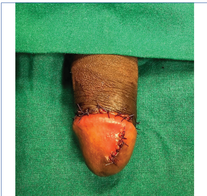
[Table/Fig-5]: Cut edges of the band were sutured after achieving haemostasis.